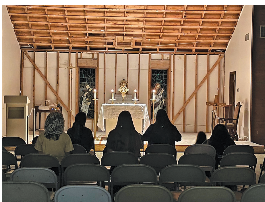
Without electricity or air-conditioning, Hurricane Laura survivors gathered for Mass on Sunday, August 30, 2020, at Saint Pius X Catholic Church only three days after the catastrophic Category 4 storm forced the church to be gutted to the studs.