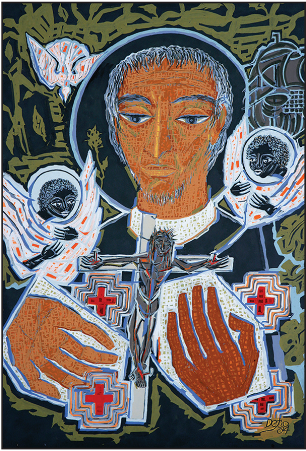
Saint Peter Claver

LAKE CHARLES — A Daytime Prayer Service honoring Saint Peter Claver, Patron of the Diocese of Lake Charles, is planned for 2:30 p.m. Sunday, September 11, at Our Lady Queen of Heaven Catholic Church, 3939 Lake Street. Everyone is invited.