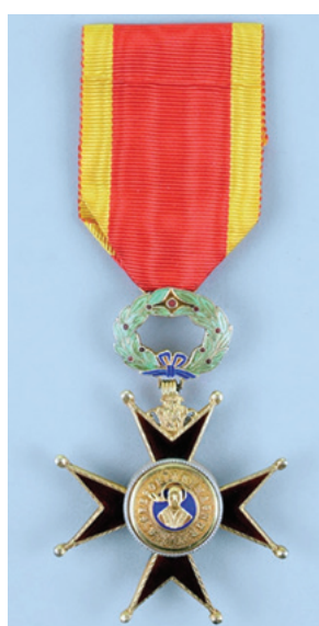
Order of Saint Gregory the Great