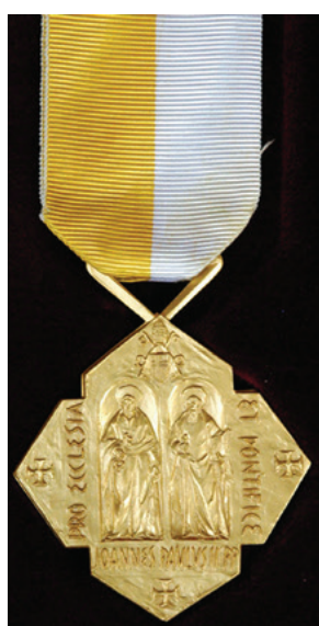
Pro Ecclesia et Pontifice

The Papal Cross Pro Ecclesia et Pontifice honor was established by Pope Leo XIII in July of 1888. The medal is awarded to Catholics aged 45 and above for distinguished service to the Catholic Church and to the Papal office. Also known as the Cross of Honor, it comes directly from the Holy See. In the Diocese of Lake Charles, the Cross is presented for services and contributions to the Catholic Church at the Diocesan level over a period of 10 years or more.