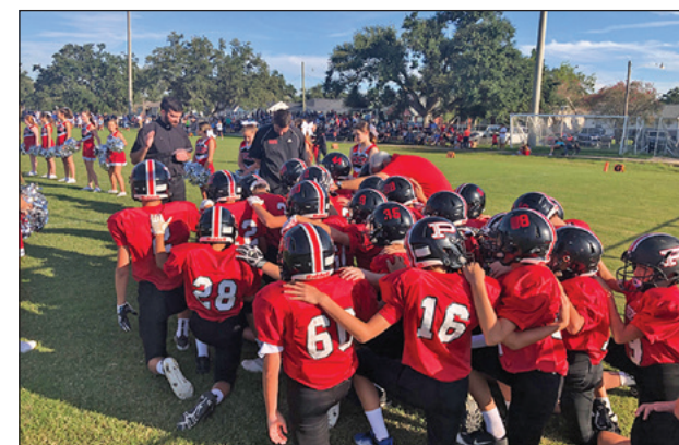
Immaculate Conception Cathedral School