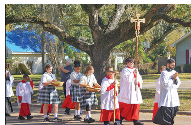
St. Margaret of Scotland Catholic School