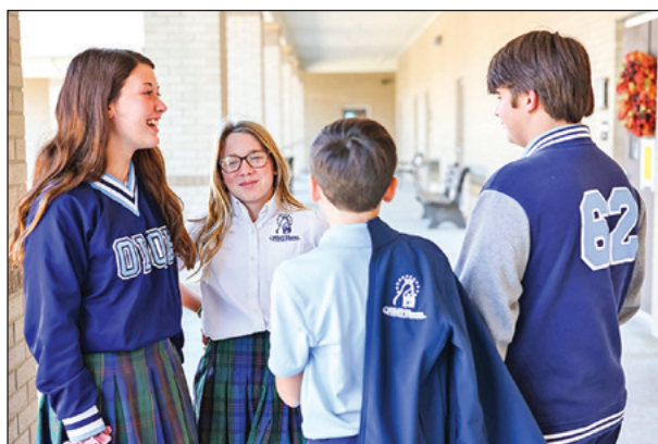
Our Lady Queen of Heaven Catholic School