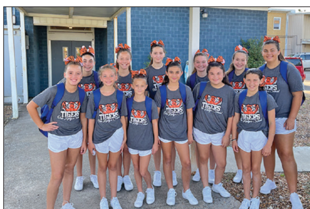
Our Lady’s Catholic School