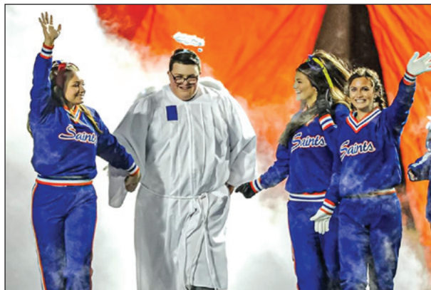
St. Louis Catholic High School