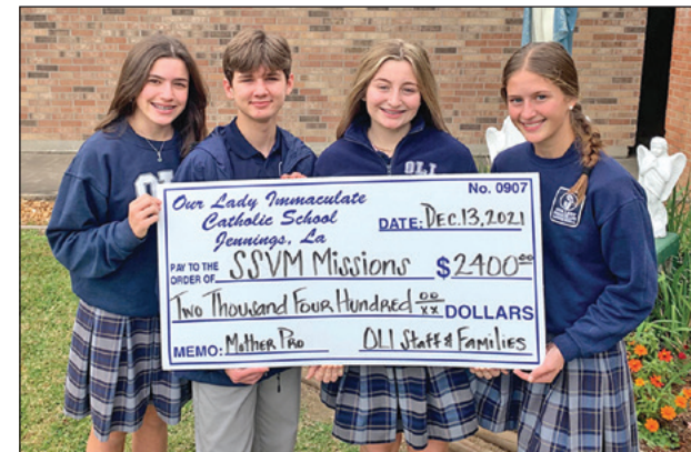
Our Lady Immaculate Catholic School