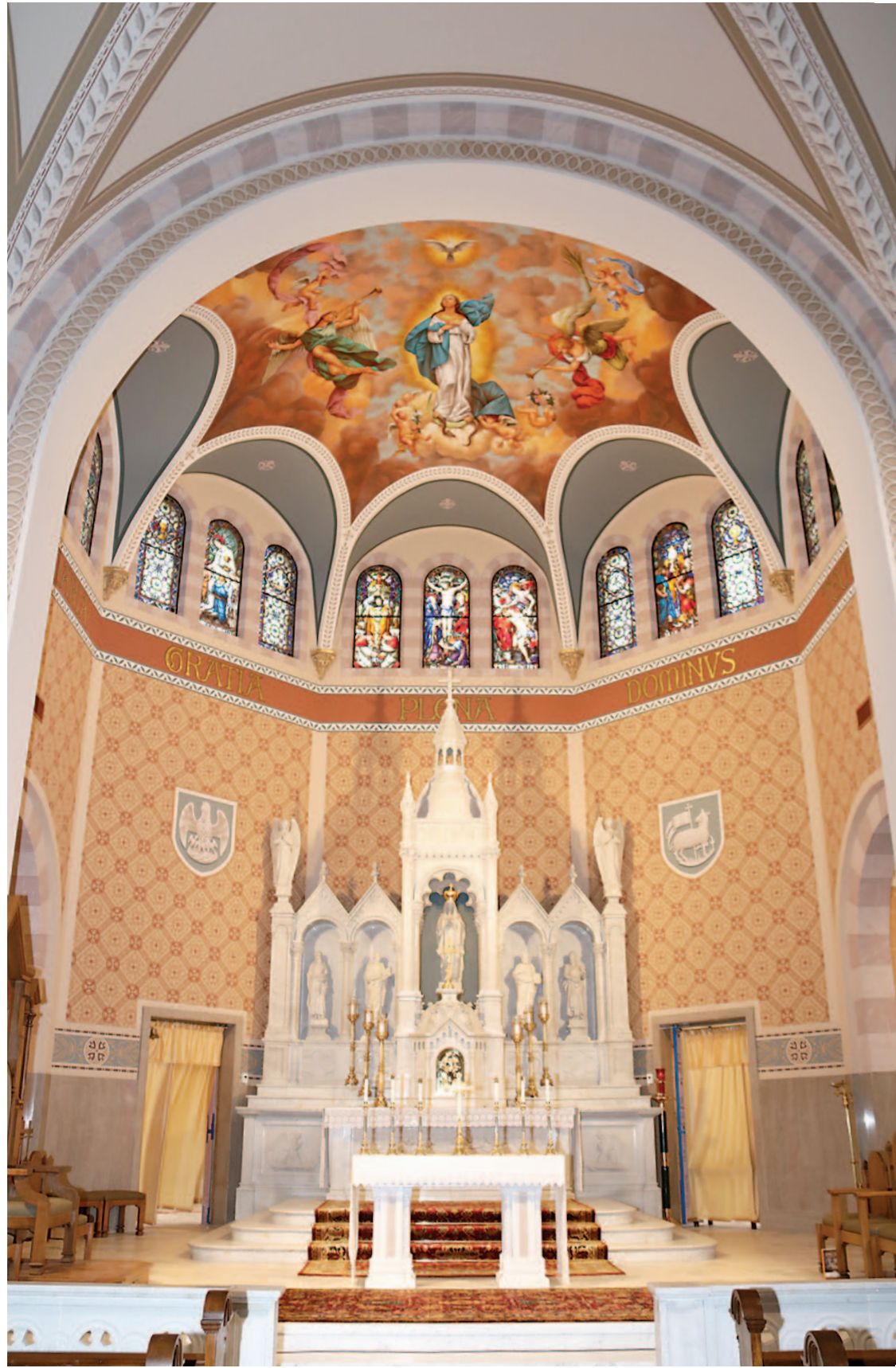
The artisans of Conrad Schmitt Studios created a magnificent image of Our Lady, located in the apse of the Cathedral.

The Great Fire of 1910 destroyed many of the buildings of commercial and government use and the Catholic Church of the Immacu-