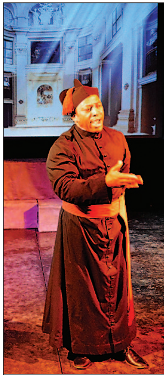
Stage portrayal of Fr. Augustus Tolton

For nearly 40 years, Saint Luke Productions has been creating inspiring live dramas, films, radio programming, and more. Their productions on the Gospels and the lives of the saints, including the acclaimed feature film Thérèse , have been seen by millions of people worldwide. For more information about Saint Luke Productions, visit www.stlukeproductions.com .