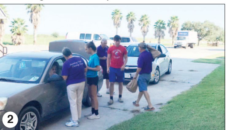
In photo 1, Catholic Charities of Southwest Louisiana volunteers load a client's vehicle during the once a month food distribution at the organization's 1225 Second Street site. Each June, clients must be recertified to receive food baskets from Catholic Charities and made possible through Second Harvest Food Bank and private contributions. Photo 2 shows the expansion of the food distribution program of Catholic Charities into lower Cameron Parish. This distribution occurs on the First Friday of each month at Sacred Heart of Jesus Catholic Church in Creole. A third food distribution site is also in operation for upper Cameron Parish at St. Mary of the Lake Catholic Church in Big Lake. For more information about qualifying for food baskets, call 337-439-7436.