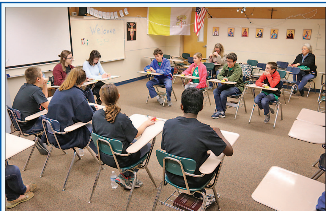
Two Quiz Bowl teams, participating in the previous competition, await a question from the proctors before pushing the button to provide an answer. The next Quiz Bowl will be held Saturday, March 3, in St. Louis Catholic High School. Registration must be done through Church parishes of the Diocese or one of the Catholic schools in the Diocese.