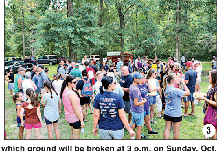
Photo 1 shows a ground view of the future site of the “The Lodge” at Camp Karol of Saint Charles Center, for which ground will be broken at 3 p.m. on Sunday, Oct. 22, presided over by Bishop Glen John Provost. Photo 2 provides a view of the completed entrance gate of Camp Karol; and photo 3, shows some of the more than 300 people who had an afternoon of fun at the Camp Karol site during the summer on a “Fun Day” with food, music, bounce houses, and more.