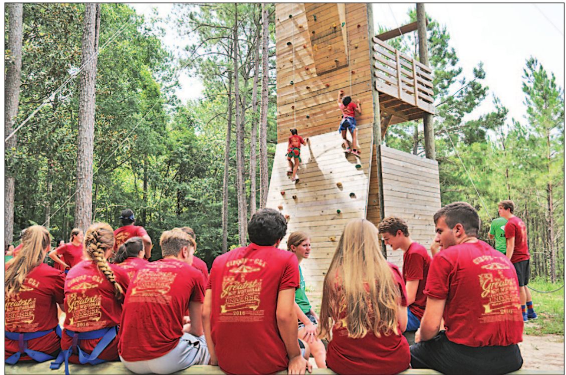
Advanced Christian Institute Leadership participants take part in a wall-climbing exercise during the 2016 program. Only 150 individuals will be accepted to take part in this year's Christian Leadership Institute to be held at Camp Maryhill in Pineville.

For additional information go to www.dolceyouth.org or call 337-439-7400, Ext. 301.