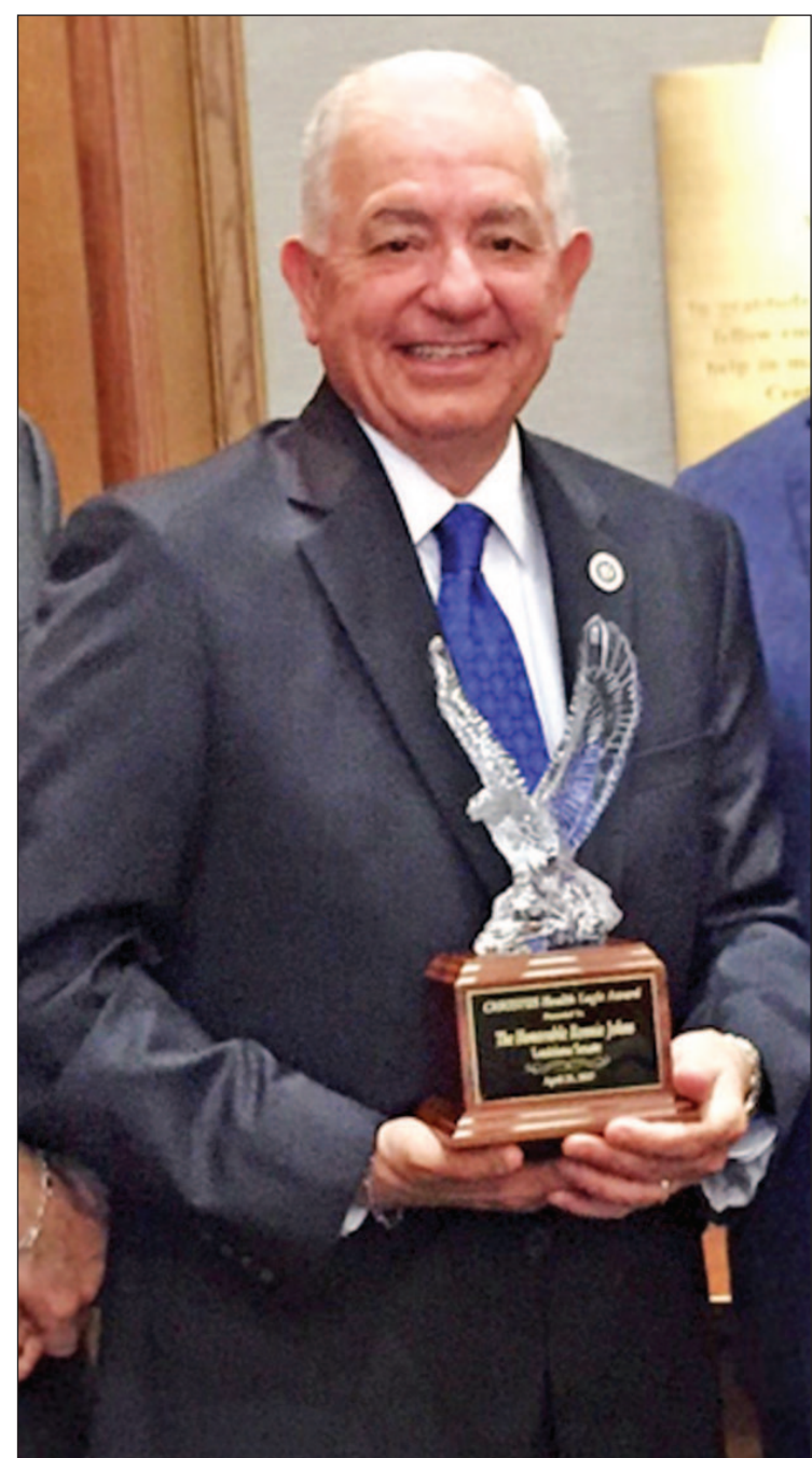
Senator Ronnie Johns

"The senator has led efforts to make sure many social justices and health related issues are addressed. These efforts don't just help