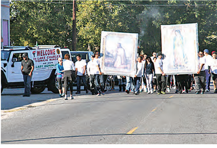
Runners in the 2014 International Run Carrera Antorcha Guadalupeana Mexico-New York Torch Race remove the images of Our Lady of Guadalupe and St. Juan Diego from vehicles for the final stretch of their first day in the Diocese moving down Eighth Avenue to St. Henry Catholic Church. This year's arrival will be on Sunday, Nov. 8, with Mass slated for 5 p.m. in St. Henry.

The religious holiday stemmed from a visitation from the Virgin Mary to an indigenous Mexican named Juan Diego in 1531. The theme of the holiday is more compassion to help indigenous people and the modern translation is solidarity across borders with the plight of immigrants.