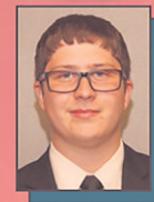
Olin Chester St. Joseph Seminary College St. Joseph Vinton