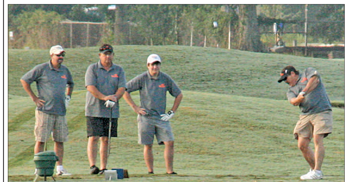
A member of one of the morning groups in last year's Bishop's Golf Classic gets the ball airborne from the tee box on the third hole at the Lake Charles Country Club