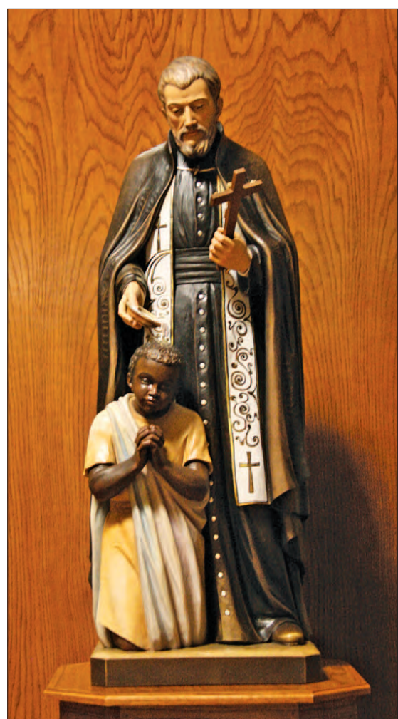
St. Peter Claver