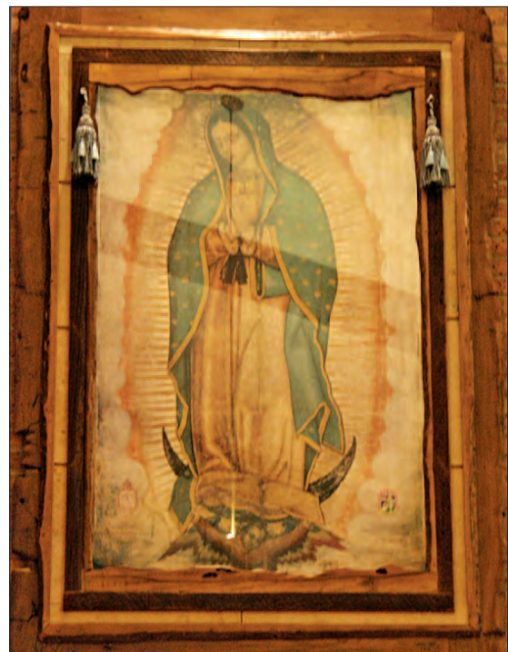
Our Lady of Guadalupe