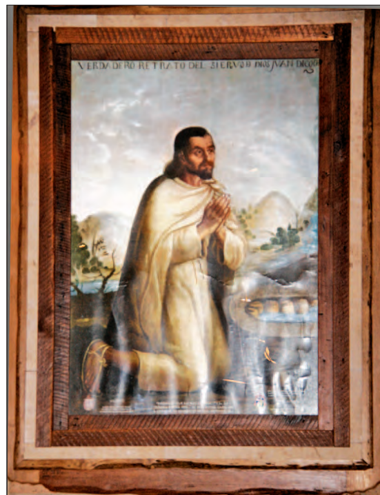
St. Juan Diego