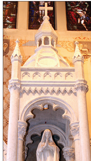
Statue of Blessed Virgin Mary

it states that she is the perfect follower of Christ. Mary is the perfect follower of Christ because she believed the words spoken to her by the angel and did the will of God. Therefore, she has undoubtedly won the "crown of righteousness" promised to those who believe in and follow Christ.