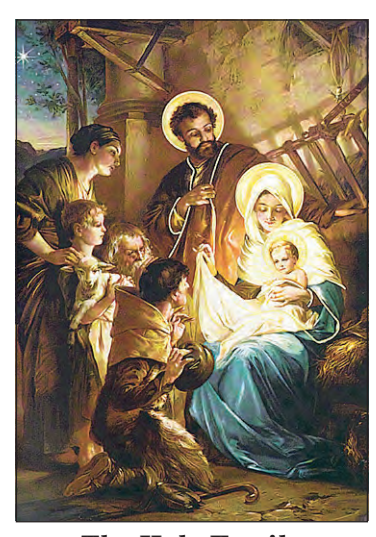
The Holy Family

Special sponsorship opportunities include Bishop's Table for a contribution of $30,000. For the donation, eight lucky individuals receive dinner with Bishop Provost at the Gala with