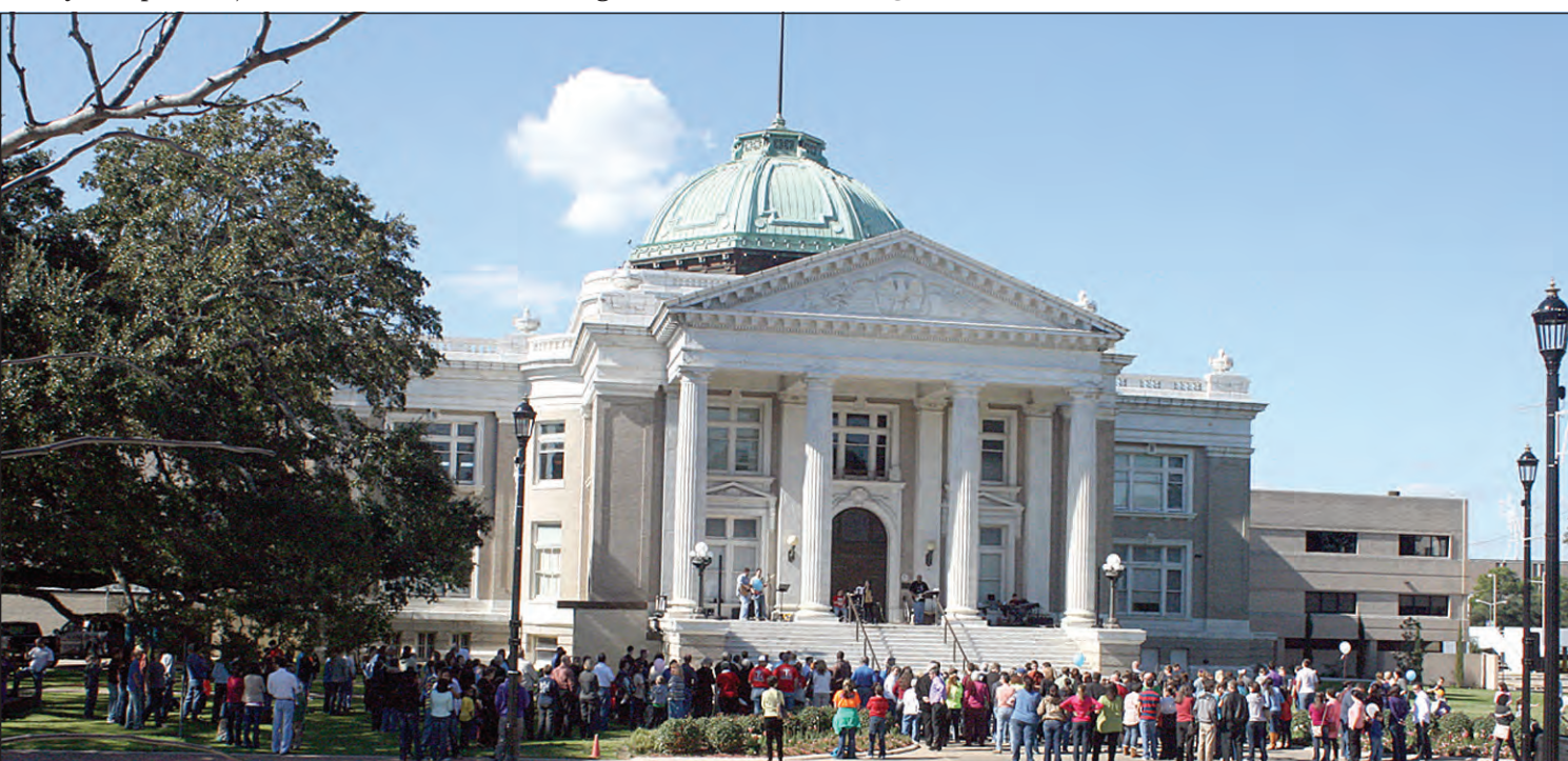
A crowd estimated between 250 and 350 were in attendance at the annual Pro-Life Rally Sunday, Jan. 20, on the steps of the Calcasieu Parish Courthouse followed by the Pro-Life Prayer Service in the Cathedral of the Immaculate Conception. The events commemorate the 1973 U.S. Supreme Court decision of Roe v Wade , which has cost the lives of more than 50 million children to abortion.