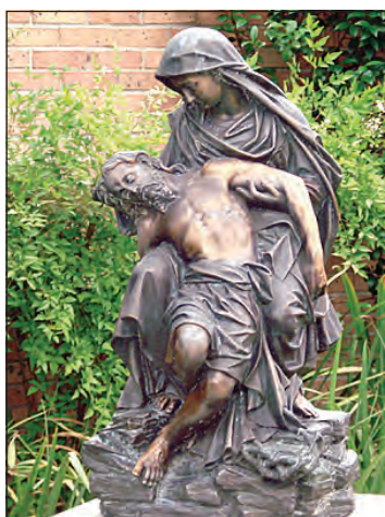
Garden of the Pieta