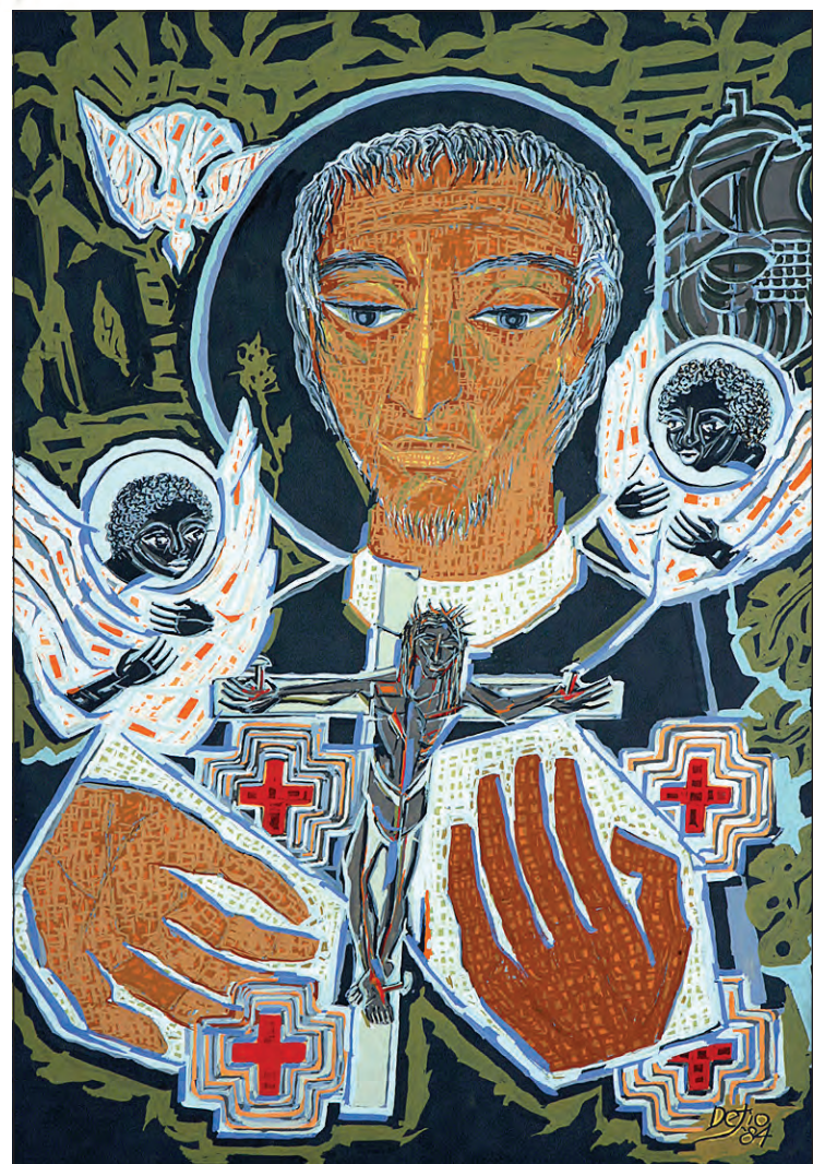
St. Peter Claver