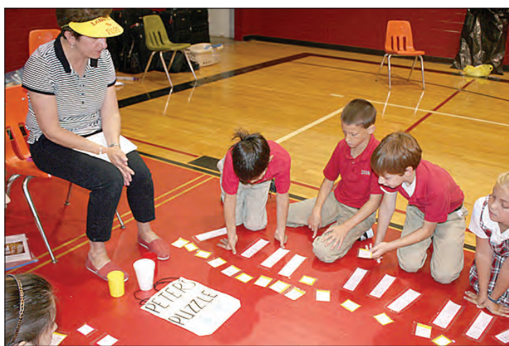
At left, students at Immaculate Conception Cathedral celebrated the Holy Father's birthday by having a "Party for the Pope", while, right, in Sulphur at Our Lady's Catholic School, students released 85 balloons to honor the celebration of Pope Benedict's birthday anniversary.

In Jennings at Our Lady Immaculate Catholic School, younger students read and learned about the life of Pope Benedict in a story called Joseph and Chico: The Life of Pope Benedict XVI as told by a Cat. The Pope is known to collect cat figurines. Specific prayers/petitions were recited at the All School Mass on Wednesday, April 11; also for Masses on Wednesday, April 18 and 25.