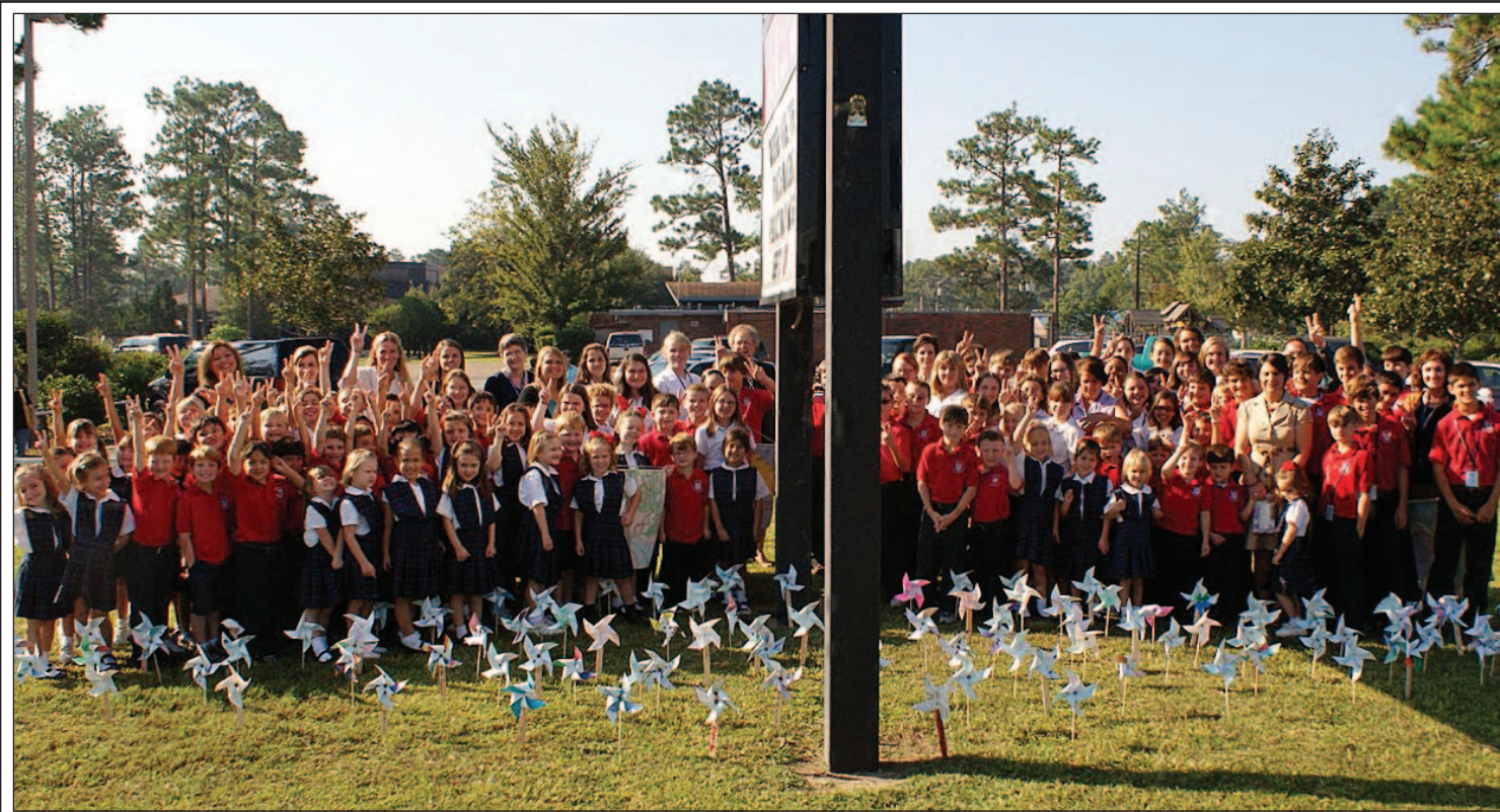
The student body of St. Theodore Holy Family Catholic School, shown here, participated in Peace One Day, a part of the United Nations' 30th International Peace Day, which is a grass-roots movement to promote world peace through education. This promotion encircles the earth through the internet's social networks, worldwide classroom education programs, and world leaders working together through the United Nations. The school's effort was Pinwheels for Peace, an art installation project begun as a way for students to express their feelings about what's going on in the world and in their lives.