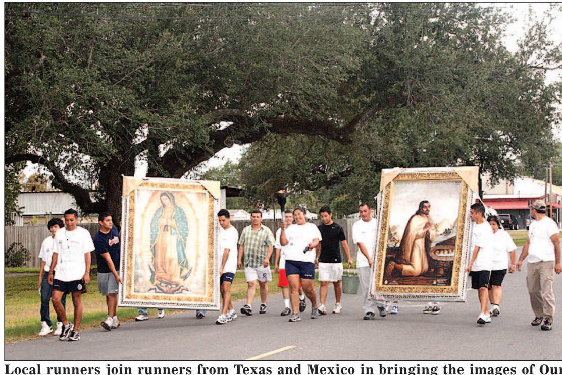
Local runners join runners from Texas and Mexico in bringing the images of Our Lady of Guadalupe and St. Juan Diego along with the Holy Fire down Eighth Avenue to St. Henry Catholic Church in 2010. This year the Run will make stops at St. Henry and at Immaculate Conception Church in Jennings over Nov. 10-12.

On Thursday, Nov. 10, the runners will be arriving from Texas at 2:30 p.m. at the Southwest Louisiana Visitors and Tourist Bureau on off I-10 near the North Beach. Following a short break the relay will continue down Lakeshore Drive to Broad Street and on to St. Henry Catholic Church, 1021 Eighth Avenue, where the torch and painted images of Our Lady of Guadalupe and St. Juan Diego will arrive at 3:45 p.m. A Rosary in the church begins at 5 p.m., with the celebration of Mass at 5:30 p.m. A covered dish celebration honoring the runners will be in the St. Henry Community Center following the Liturgy. Everyone is invited to attend all events and to honor the passing of the Holy Fire and the images of Our Lady and St. Juan Diego down the streets of Lake