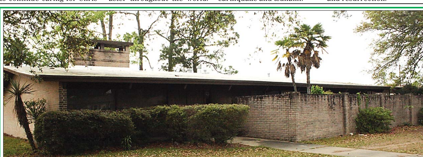
The former faculty residence at St. Louis Catholic High School will be renovated for use as Vianney House, a residence for those who want to discern seriously God's call to a vocation to the diocesan priesthood but who have not yet made a decision to enter the seminary.

The Good Friday collection assists the shrinking Christian community in the Holy Land, a community that struggles to remain in the land of Christ's birth, death and resurrection