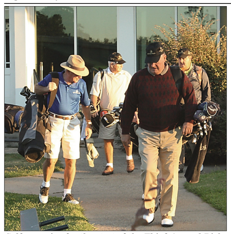
Golfers arrive for the start of the Third Annual Bishop's Golf Classic held at the Lake Charles Country

SULPHUR -- Seventeen members of Our Lady of Prompt Succor Church spent five days in New Orleans in the Treme district, helping people whose homes had been and still were affected by the 2005 passage of Hurricane Katrina5. The group of nine adults and eight teenagers worked at scraping down and painting homes in response to the "Operation Helping Hands" program of the Archdiocese of New Or-