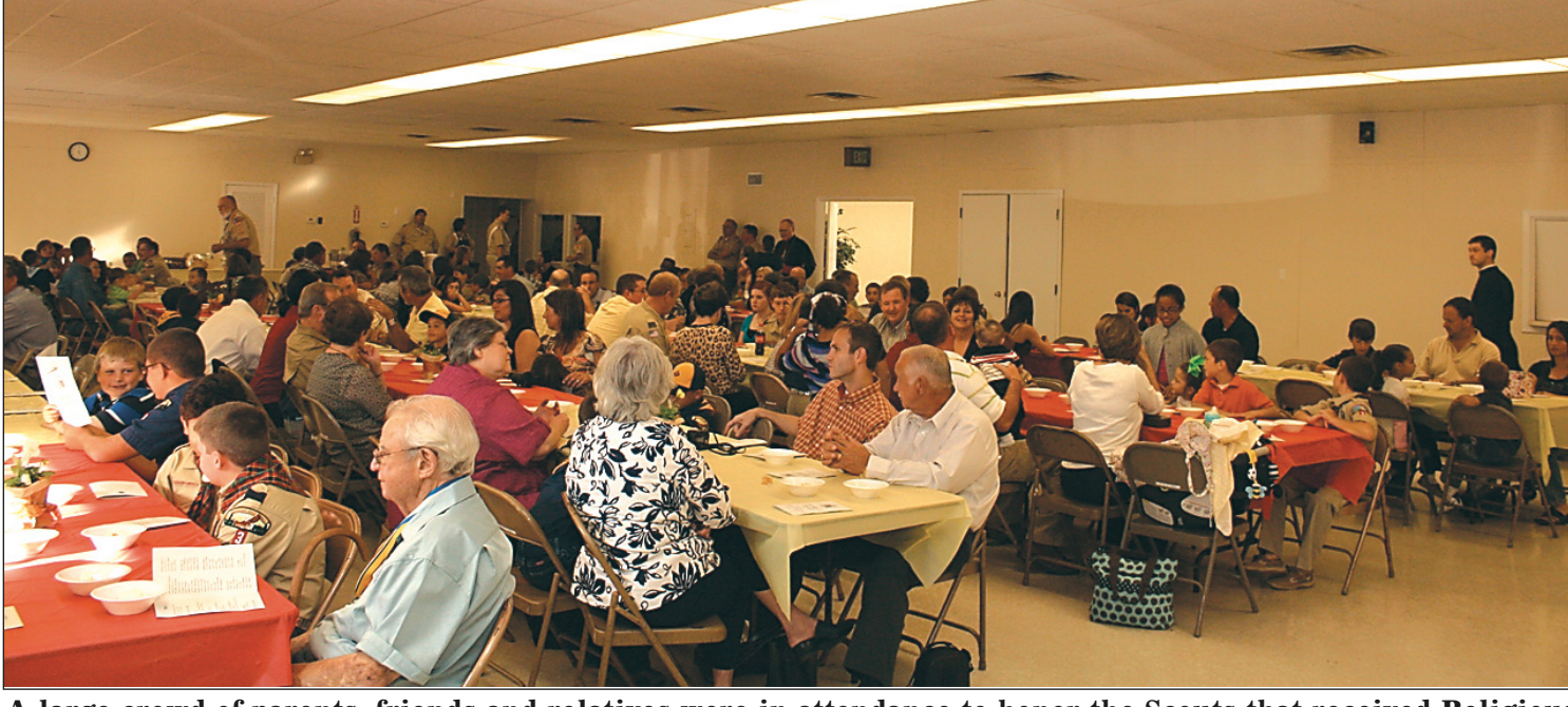
A large crowd of parents, friends and relatives were in attendance to honor the Scouts that received Religious Emblems recognition at the Bishop's Dinner.

Men should call 337-439-7400 to register for the Prayer Breakfast.