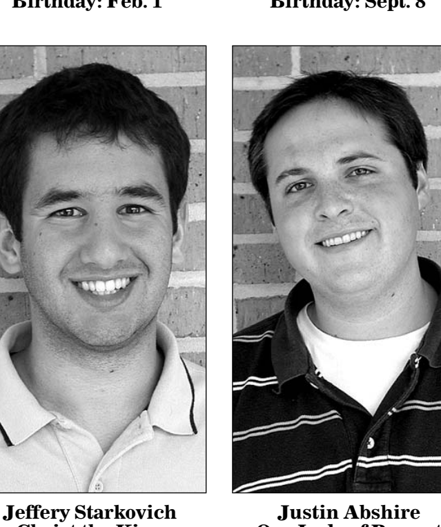
Our Lady of Prompt Succor Sulphur Freshman St. Joseph Seminary College